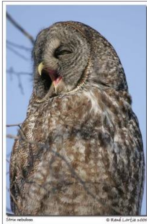
Figure 1: Owl

Figure 1 displays a magnificent owl from Lapland.