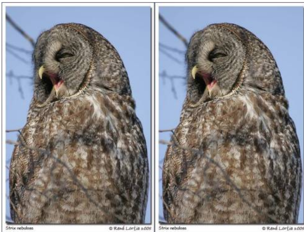
Figure 2 illustrates the placement of two images side by side.